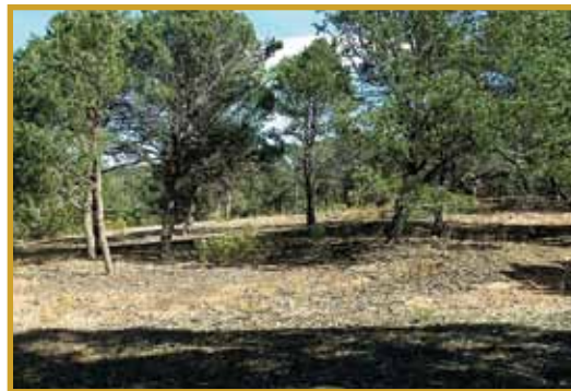
Figure 7: Chipping slash from a piñon-juniper management project.

minimum five feet of space between tree crowns. Spacing reduces competition and allows remaining trees space to grow. Random clumps of trees may be left and occasional larger openings created for greater forest diversity.