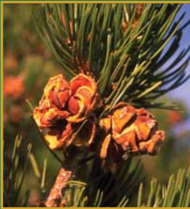
Figure 6: Characteristics of piñon include: