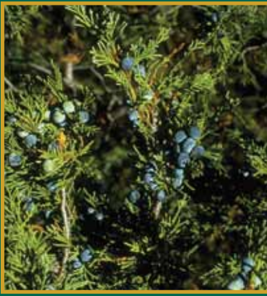
Figure 5: Characteristics of Rocky Mountain juniper include: