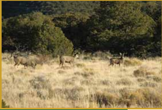
Figure 2: Mule deer are commonly found in piñon-juniper forests.

Juniper dominated woodlands tend to include open savannahs of scattered trees with significant shrub cover, except in areas where sagebrush has become dominant. Scattered openings and shelter from remaining trees help sustain healthy populations of understory grasses, shrubs and forbs. Due to the lack of natural disturbances and proactive forest management, tree densities have increased to a level that will support damaging crown fires.